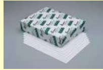
Reams of white copy paper

If you can bring in any of the following, email me at gross2@wcpss.net before you purchase and send in, so everyone doesn't get the same thing.